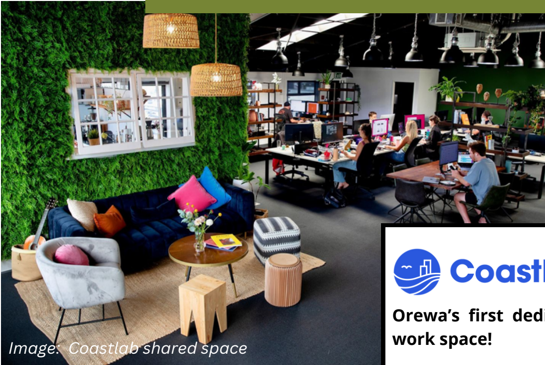
Image: Coastlab shared space

Orewa Community Centre is temporarily closing from November to undergo key maintenance and roof works. It is anticipated that these works will be completed by November 2024 .